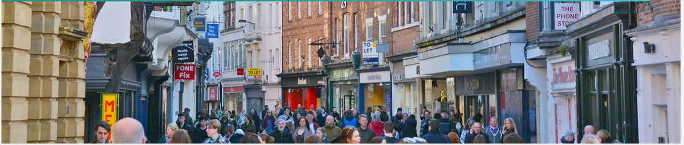
Photograph from StreetLife York